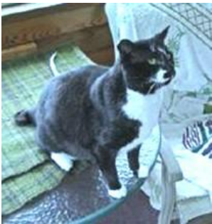
Ken, fully recovered