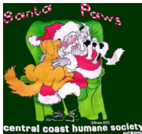
Santa Paws, Hunter Green t-shirt