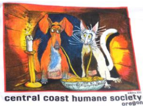
Spay-getti, No Balls, White t-shirt

We truly appreciate your support. Thank you!