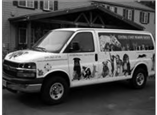
The CCHS van, which has a multitude of uses!

The van became a real attention grabber when used during our visits to public schools in support of our education program. Every month now, a pallet of food is distributed throughout the county to colony managers for them to feed their community cats.